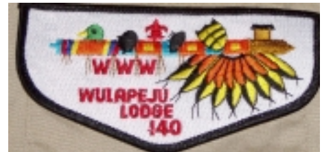
OA badge of the most recently elected OA member of Troop 165—Patrick Brady—See Scout Spotlight on page 3

Order of the Arrow on January 22. Order of the Arrow members from another Troop will be attending our meeting that night to conduct the election. This is not like an election for leadership positions; campaigning for votes is strictly prohibited, and will result in being removed from the ballot. When voting, Scouts can vote for as